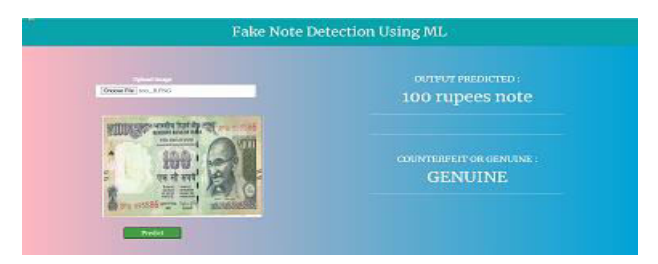
Figure 2: Detecting Genuine note using Image dataset

Figure 1 describes about the entry screen. This screen contains two options i.e., Numerical dataset and Image dataset. When we click on the Numerical dataset option the currency is detected whether it's genuine or counterfeit using thevariance, skewness, kurtosis and entropy values of the note and when we click on the Image dataset option the currency is detected whether it is genuine or counterfeit using dominant parts of image of currency note such as identification marks, latent image and security thread.