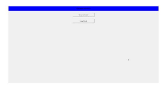
Figure 1: Entry Screen

Figure 1 describes about the entry screen. This screen contains two options i.e., Numerical dataset and Image dataset. When we click on the Numerical dataset option the currency is detected whether it's genuine or counterfeit using thevariance, skewness, kurtosis and entropy values of the note and when we click on the Image dataset option the currency is detected whether it is genuine or counterfeit using dominant parts of image of currency note such as identification marks, latent image and security thread.