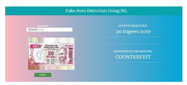
Figure 3: Detecting Fake note using Image dataset

Figure 2tells about detecting the genuine note using the image dataset. To detect whether the currency is genuine here we have considered the parameters such as identification marks, latent image and security thread.